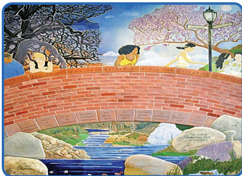
CATS' Donor Wall

We are extremely excited about the new developments here at CATS. With our CARF accreditation and construction of the building addition, CATS will continue to provide the high quality, cost-effective, holistic, abstinence-based treatment services we are known for throughout the region. Thank you again for your continued support as we look to 2013 for bigger and better things here at Community Assessment & Treatment Services, Inc.