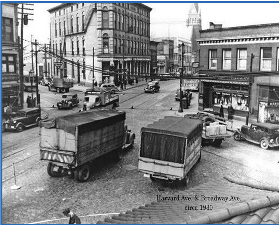
Our Neighborhood - The intersection of Harvard Ave. & Broadway Ave in Slavic Village